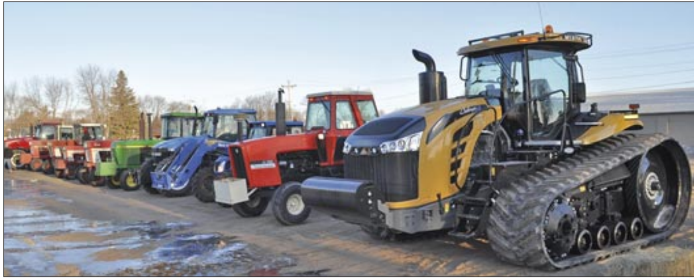
Enterprise photo by Kurt Menk